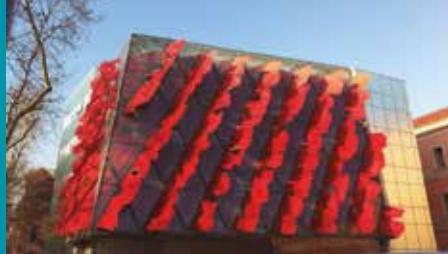
Mercè Rodoreda Building, site of the Barcelona Graduate School of Economics