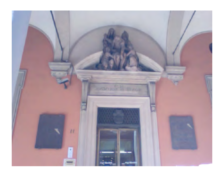
Figure 4: Monte di Pietà di Bologna