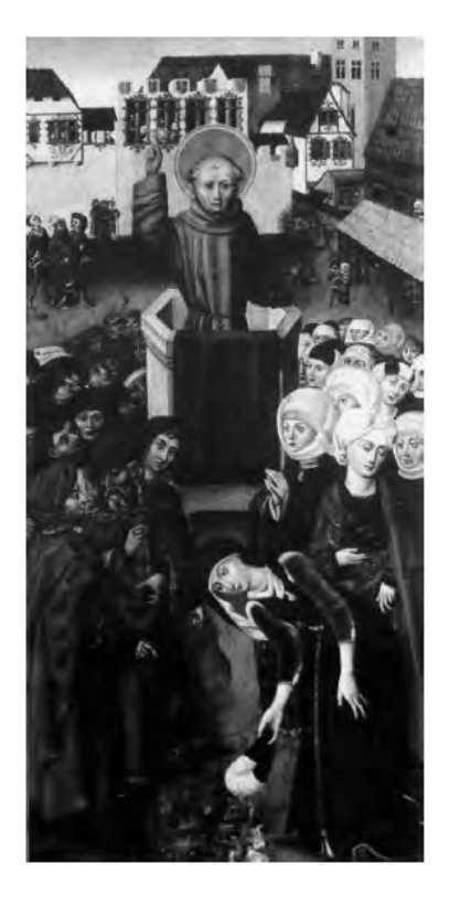
Figure 3: The sermon of Saint Giovanni da Capestrano, Historisches Museum.